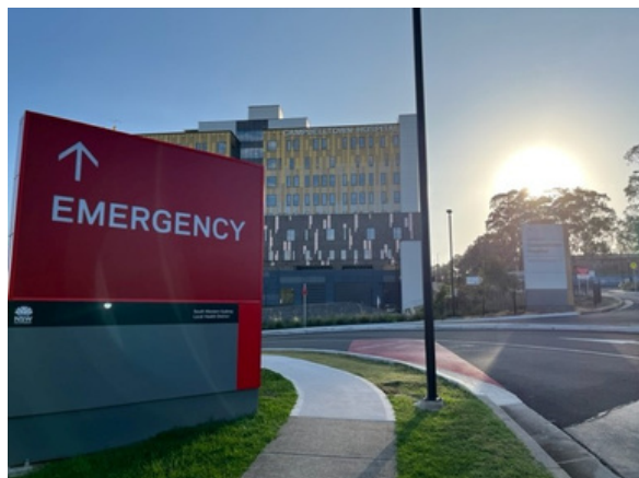
Pictured: Campbelltown Emergency Department

The project welcomed four Undergraduate Speech Pathology students in February. They joined the team for a six-week student placement block.