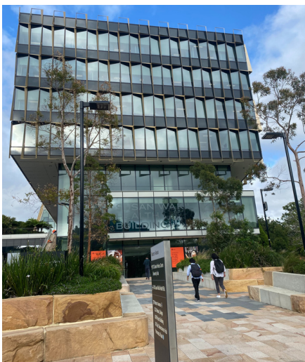
University of Sydney - Susan Wakil Health Building

We have partnered with four target sites: SWSLHD Oral Health Services, SWSLHD Campbelltown Emergency Department, WNSWLHD Oral Health Services and WNSWLHD Perioperative Services. In the coming weeks we will be conducting surveys and interviews with health care workers and consumers. This research will allow us to identify any communication access issues, which will inform the co-design process. We're looking forward to sharing our discoveries with you all!